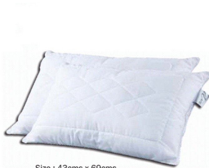
Size : 43cms x 69cms