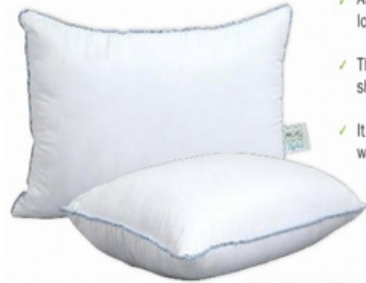
Size : 43cms x 69cms