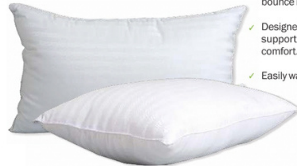
Size : 43cms x 69cms, 41cms x 61cms, Twin Pack (41cms x 61cms)