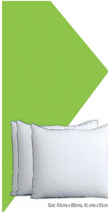
Size: 43cms x 69cms, 41 cms x 61cms