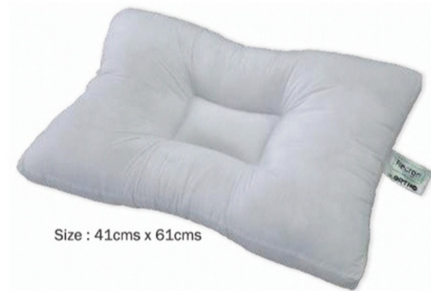
Size : 41cms x 61cms